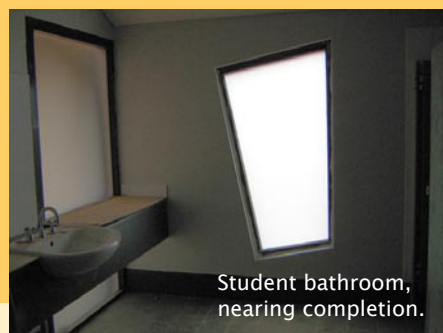
Student bathroom, nearing completion.